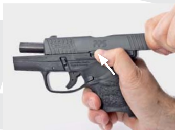
3.2.3 Fig. 1

To lock the slide in the open position, allow the slide to move slightly forward from the rearmost position while pressing upward on the slide stop (3.2.3 Fig. 1).