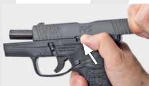
5.1.1 Fig. 3