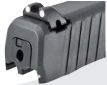
6.1 Fig. 1

Windage adjustments are made by drifting the steel rear sight from side to side with the rear sight adjustment tool. To adjust, move the rear sight in the direction you wish the group to move on the target. For example: if the group should move to the right, move the rear sight to the right.