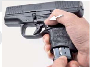
4.5 Fig. 1