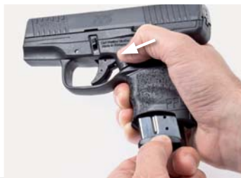
3.2.2 Fig. 1

Grasp the pistol with your finger off the trigger and outside the trigger guard. Depress the magazine release and remove the magazine (3.2.2 Fig. 1).