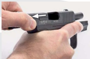
4.1 Fig. 2