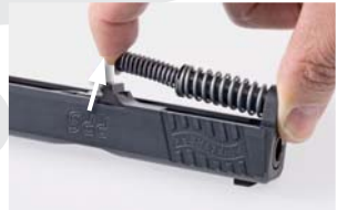
5.1.1 Fig. 6