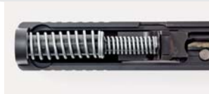
5.1.2 Fig. 4: Spring correctly aligned