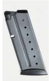
4.2 Fig. 1