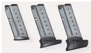
3.2.4 Fig. 1

The capacity of the magazine depends on the size of the magazine floorplate. Three different magazine capacities are available.