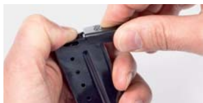
5.2.2 Fig. 1

1. Install the magazine spring and follower and the floorplate catch in reverse order into the tube in exactly the same orientation as they were in when they were first removed during disassembly.