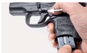
5.1.1 Fig. 1