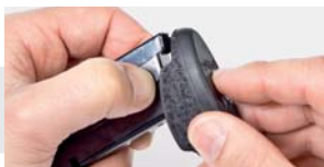
5.2.2 Fig. 2

2. While holding the floorplate catch in the tube, slide the floorplate onto the tube so that the round projection of the floorplate catch engages the hole in the floorplate. There will be an audible “snap” heard (5.2.2 Fig. 1).