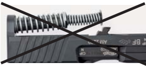
5.1.2 Fig. 5: Spring not seated