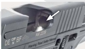
5.1.1 Fig. 4