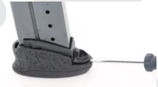
5.2.1 Fig. 2