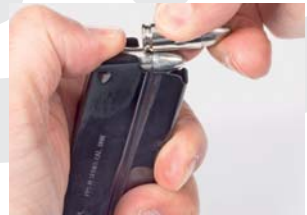
4.2.1 Fig. 2

Load the magazine by pressing a cartridge base (rear of cartridge) downward on the forward portion of the magazine follower (or downward on the case of a previously loaded cartridge) and sliding the cartridge fully under the lips of the magazine until the cartridge base is against the rear wall of the magazine. Repeat the procedure for the number of cartridges you wish to load, up to the magazine capacity (4.2.1 Fig. 2).