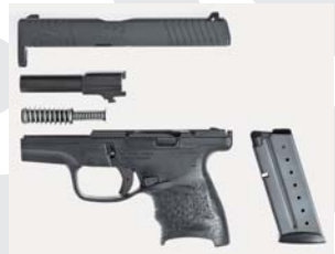
5.1.1 Fig. 7