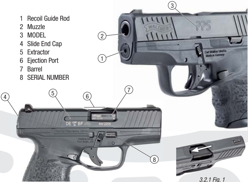
3.2.1 Fig. 1