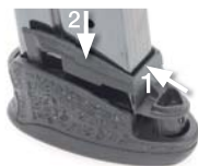
5.2.2 Fig. 3

3. For magazines with medium or large floorplate: Hold the Dust Cover with its pins facing downward and slide it over the magazine tube starting from the magazine's rear wall (5.2.2 Figure 3, step 1). Press the Dust Cover gently and smoothly from the top into the magazine's floorplate (5.2.2 Figure 3, step 2).