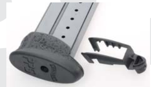
5.2.1 Fig. 3