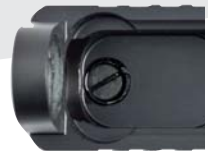
6.1 Fig. 2

Assembly is in reverse order. Lightly tighten the front sight screw (6.1 Fig. 2). Remember to make sure the screw and the thread inside the steel front sight are free of oil or grease. The thread of the front sight screw should be secured using an industrial adhesive (for example Loctite 648). To tighten the front sight screw, apply a torque of 8.8 inch lbs (1 Nm).