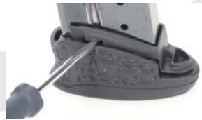
5.2.1 Fig. 1