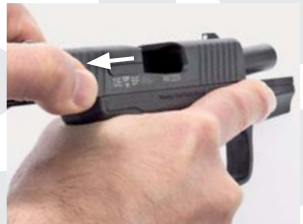
4.5 Fig. 2