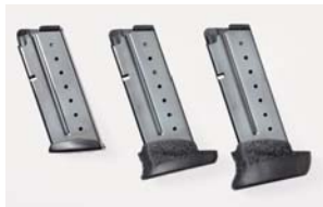
6.2 Fig. 1

With three magazines of different length available for each caliber (6.2 Fig. 1), the PPS frame length can be adjusted to fit any hand size.