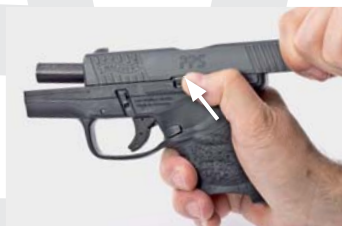
4.1 Fig. 3