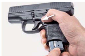
4.1 Fig. 1