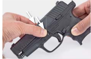
5.1.1 Fig. 5