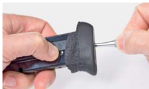
5.2.1 Fig. 4