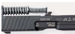
5.1.2 Fig. 6: Spring correctly seated