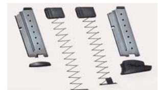
5.2.1 Fig. 5