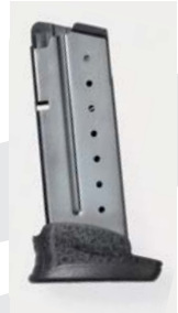
4.2.1 Fig. 1