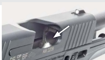
4.1 Fig. 4