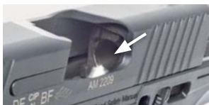
4.5 Fig. 4