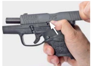
4.5 Fig. 3