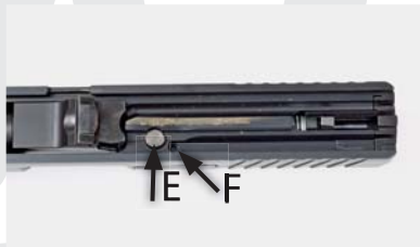
5.4 Fig. 2