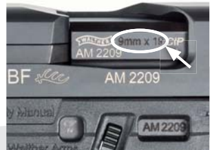
2 Fig. 1

Locate the cartridge designation marked on the handgun. This information indicates the ammunition that must be used in this firearm (see 2 Fig. 1). You are responsible for selecting ammunition that meets industry standards and is appropriate in type and caliber for this firearm.