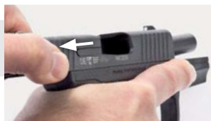
5.1.1 Fig. 2